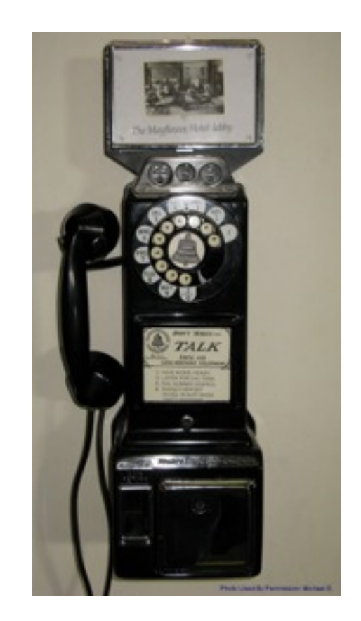
Pay Phone in the Mayflower Hotel. It all began with a phone call.

Note: This service presents an outstanding opportunity for a sponsor to demonstrate to a sponsee how to perform 12 step calls.